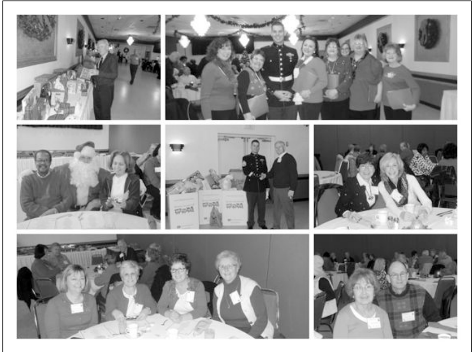
Breakfast with Colleagues

We collected approximately 100 wonderful toys and over $400 for Breast Cancer. Thank you for making this social event a huge success.