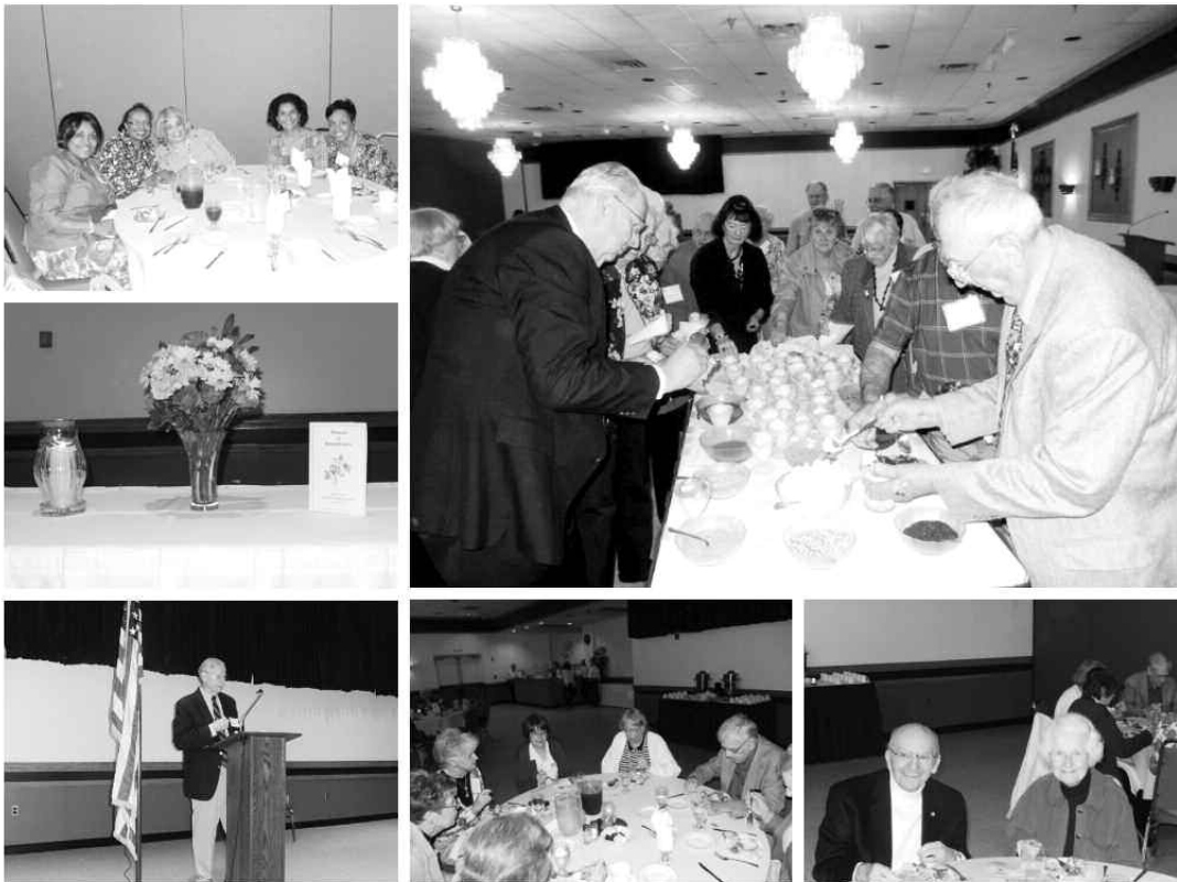
Annual Luncheon Meeting April 21, 2015