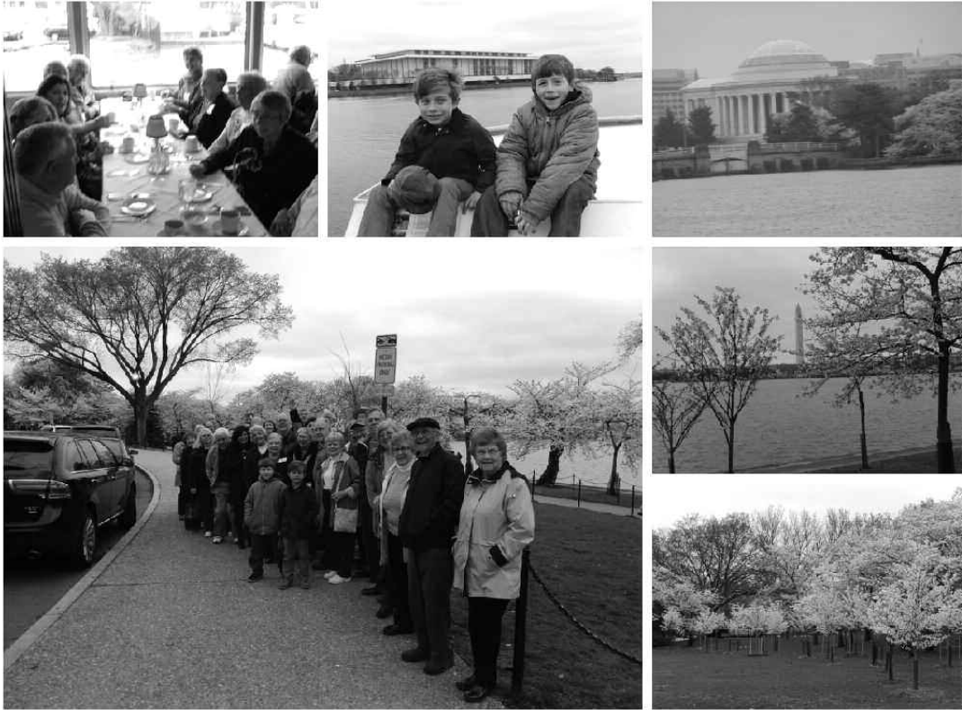
Cherry Blossom Cruise on April 8, 2015